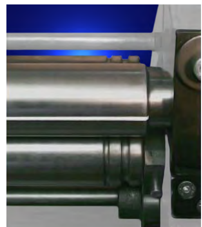
Optional slot in upper roll and wiring grooves