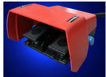
Two pedal footswitch for a quick change of the rotation direction