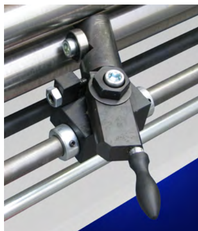
Optional stop for conical rounded parts