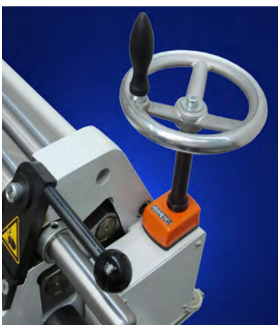
Radius adjustment with mechanical digital display