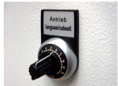
Variable speed adjustment

... by opening the quick release lock the rounded pipe can be removed from the moveable upper roll.