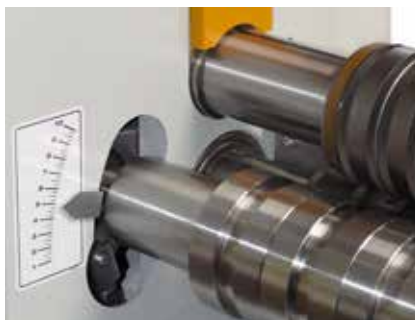
Scale for radius adjustments