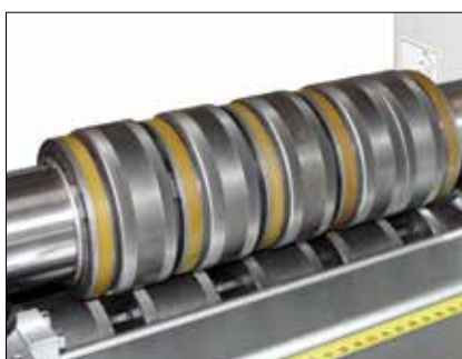
Rolls for standing seam and snap-lock seam.