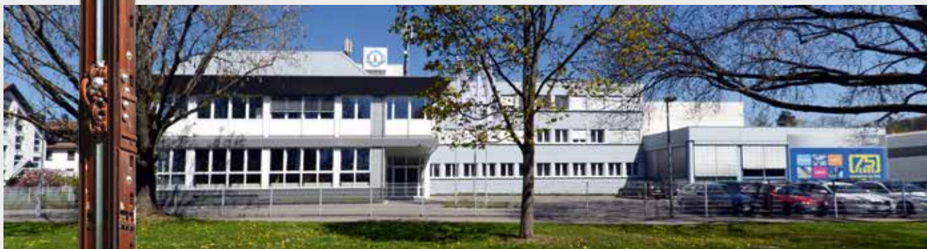
Headquarters in Sindelfingen. In the foreground „Steel object“.