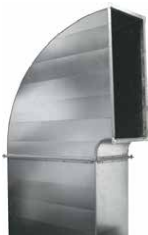
For rounding elbow blanks with Snaplock, Pittsburgh or Standing seams.