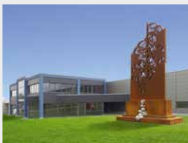
Efringen - factory and artwork