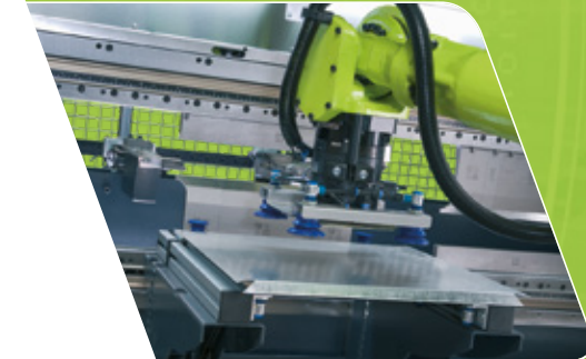
Turning over sheets