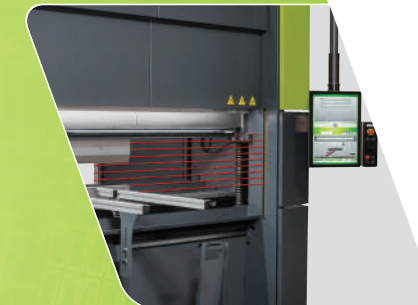
Integrated safety lightscreen